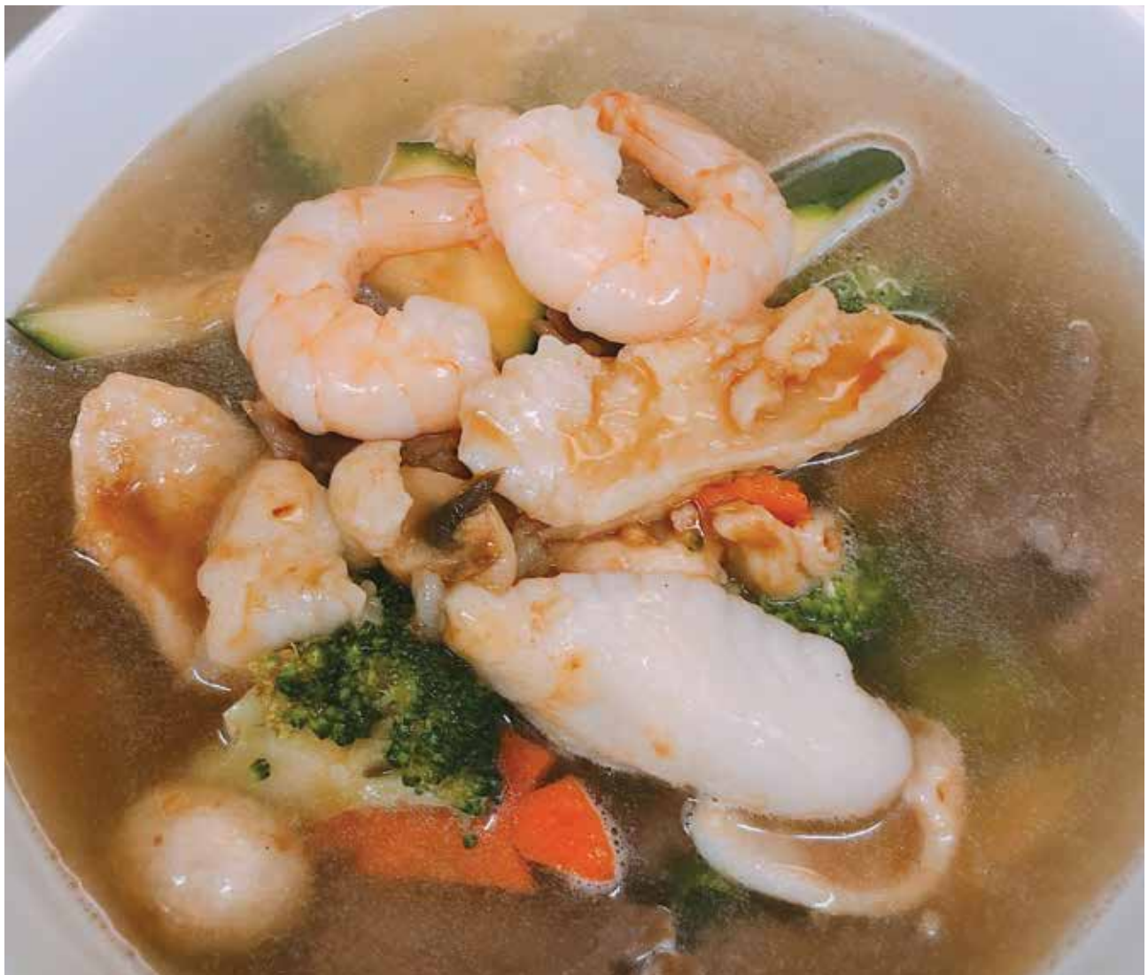
Combination Short Soup (Main Meal)

Combination Long Soup (Main Meal) $24.00