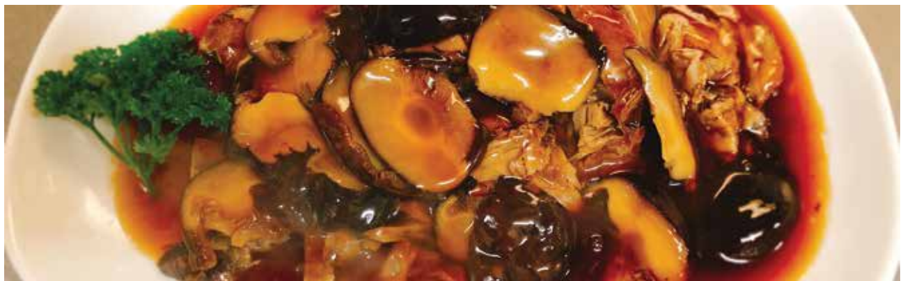
Steamed Duck with Chinese Mushroom Sauce