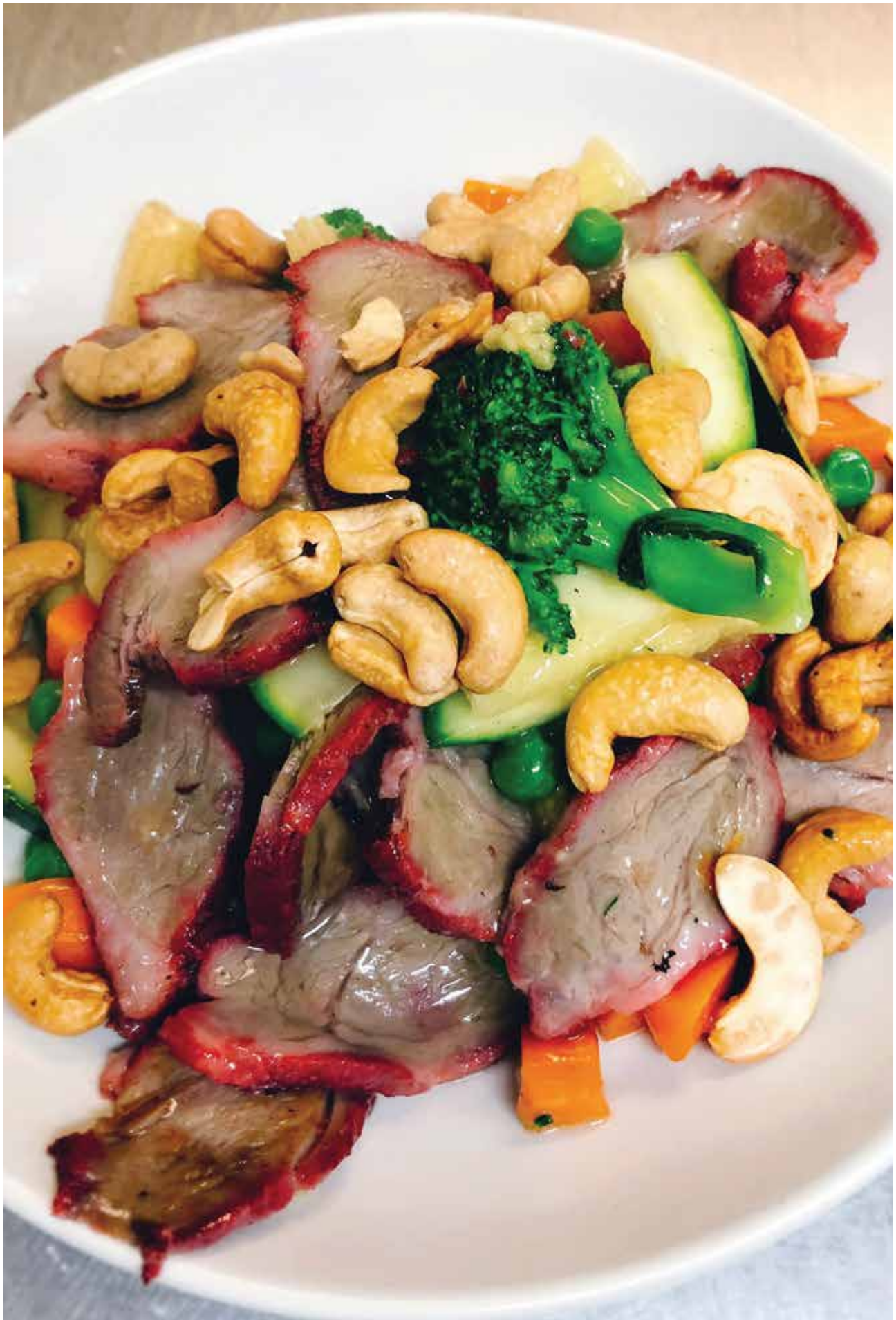
GF BBQ Pork with Cashew nuts