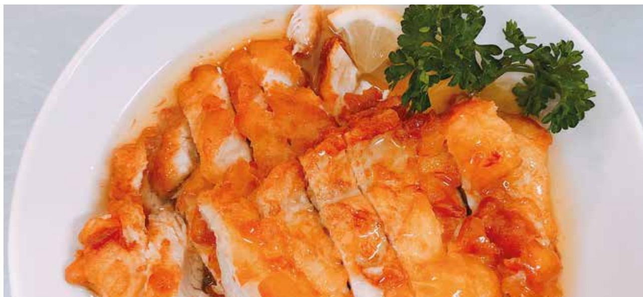
Deboned Chicken Breast with Lemon Sauce