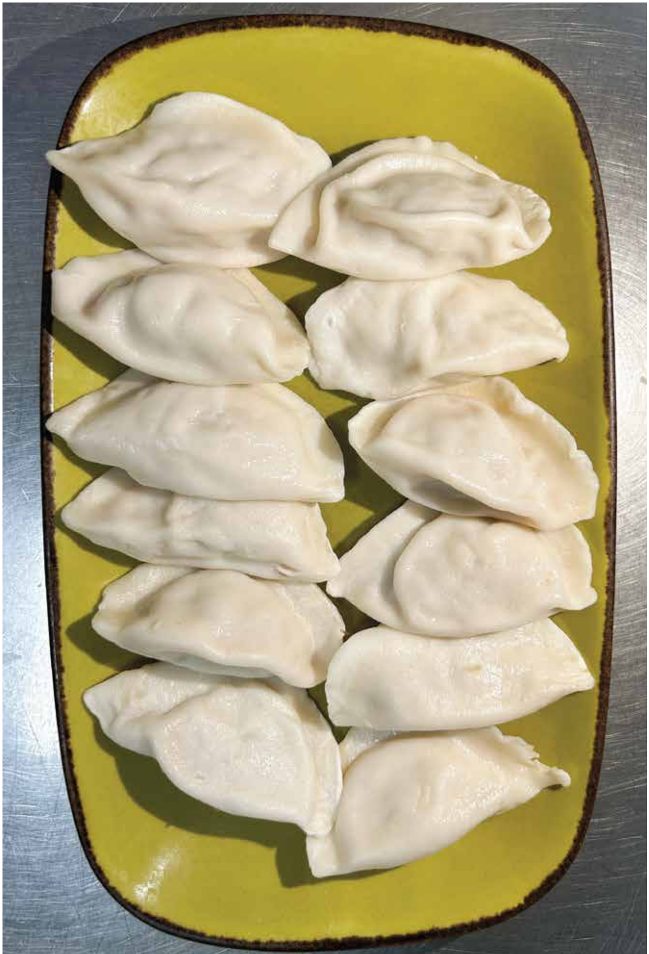
Boiled Pork and Vegetable Dumplings