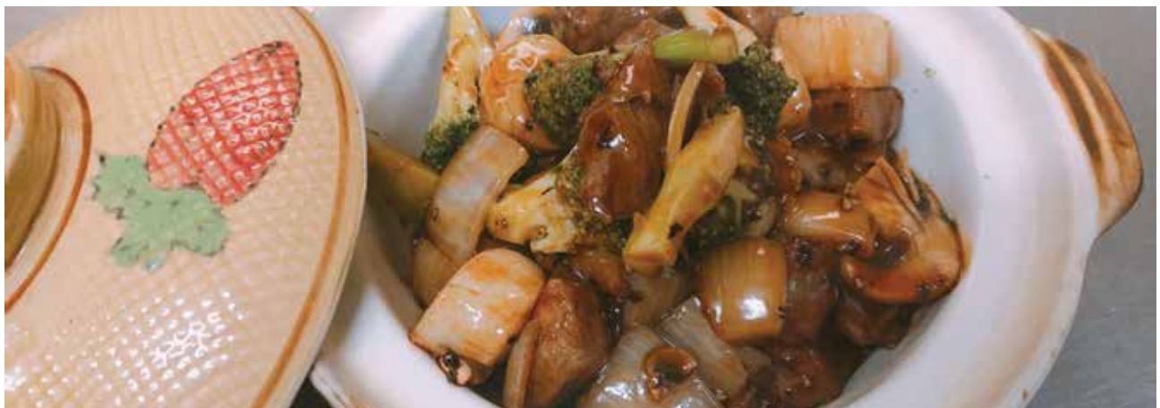
Pepper Sauce Beef Steak & Scallops Hot Pot