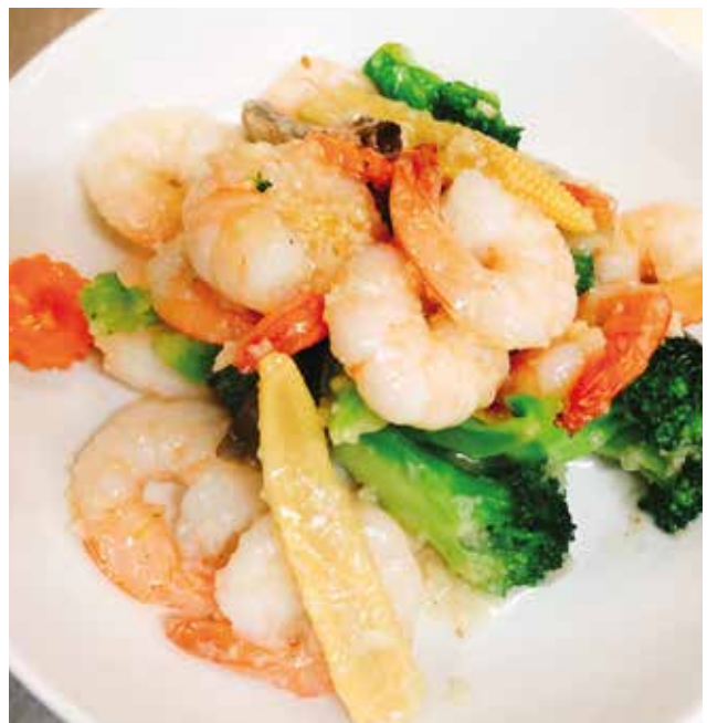
King Prawn with Garlic Mushroom & Vegetables