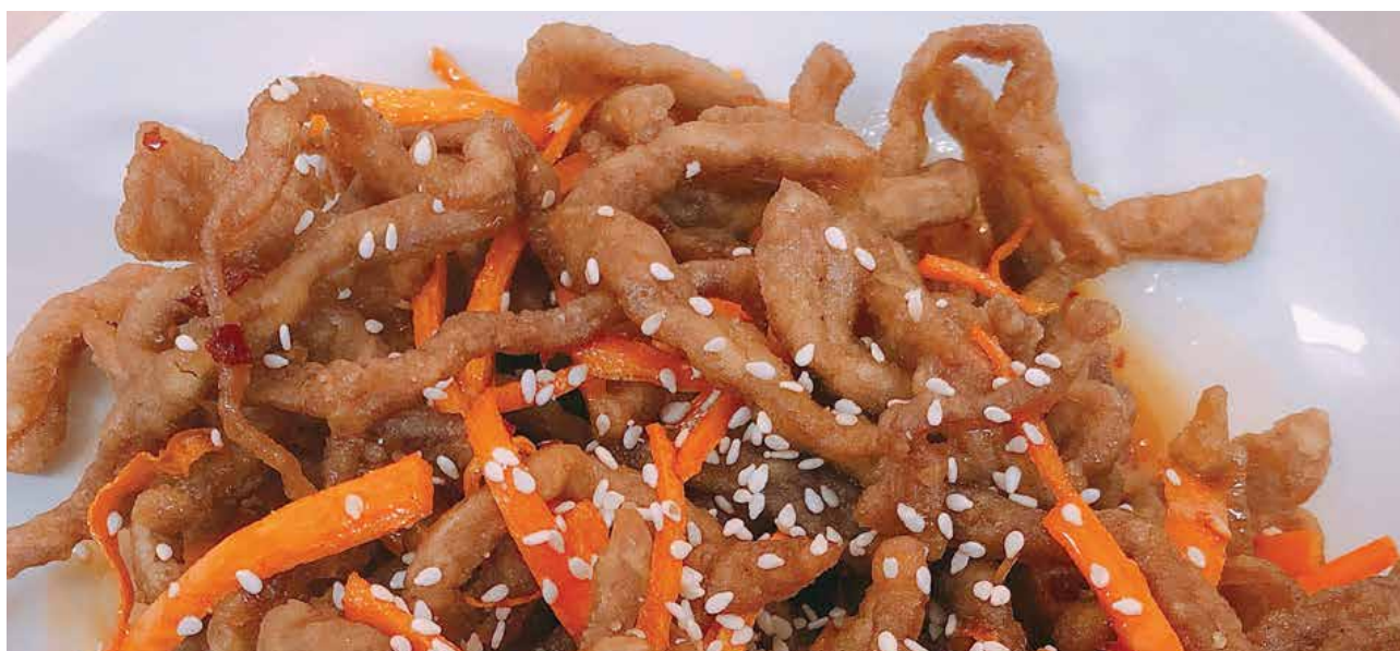
Peking Chilli Shredded Beef