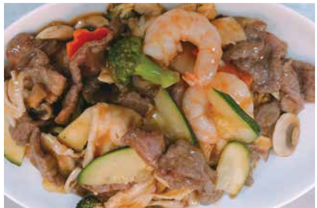
Combination Chow Mein