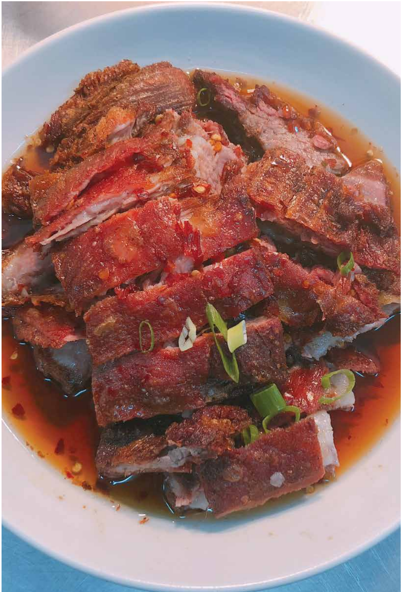
Dry Fried Spicy Lamb