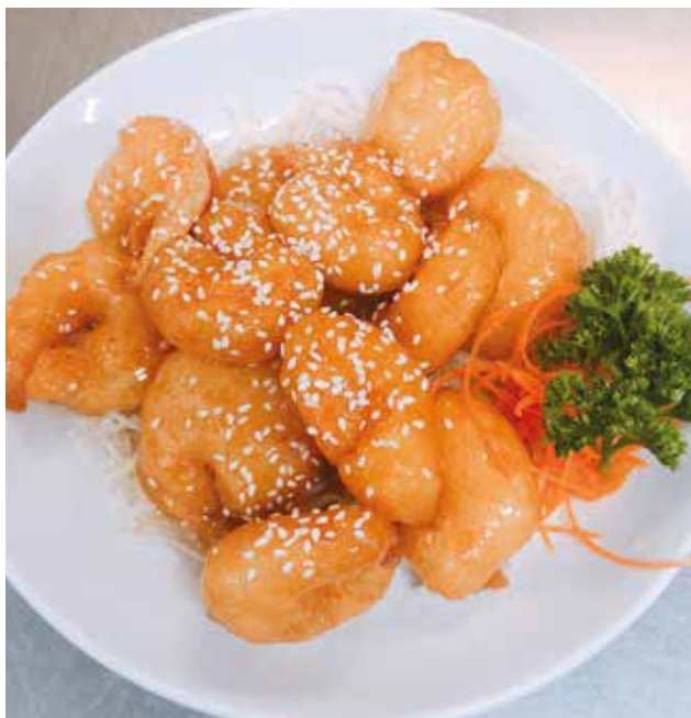
Honey King Prawn