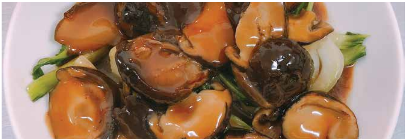
Chinese Shanghai Pak Choy