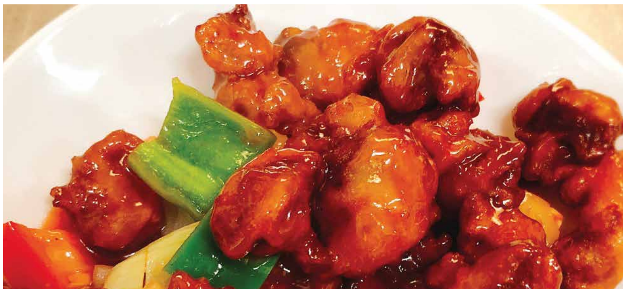
Sweet & Sour Pork