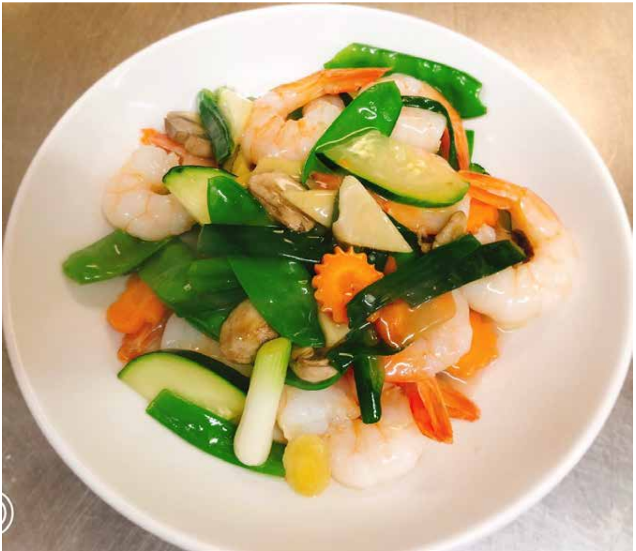
King Prawn Ginger and Shallot