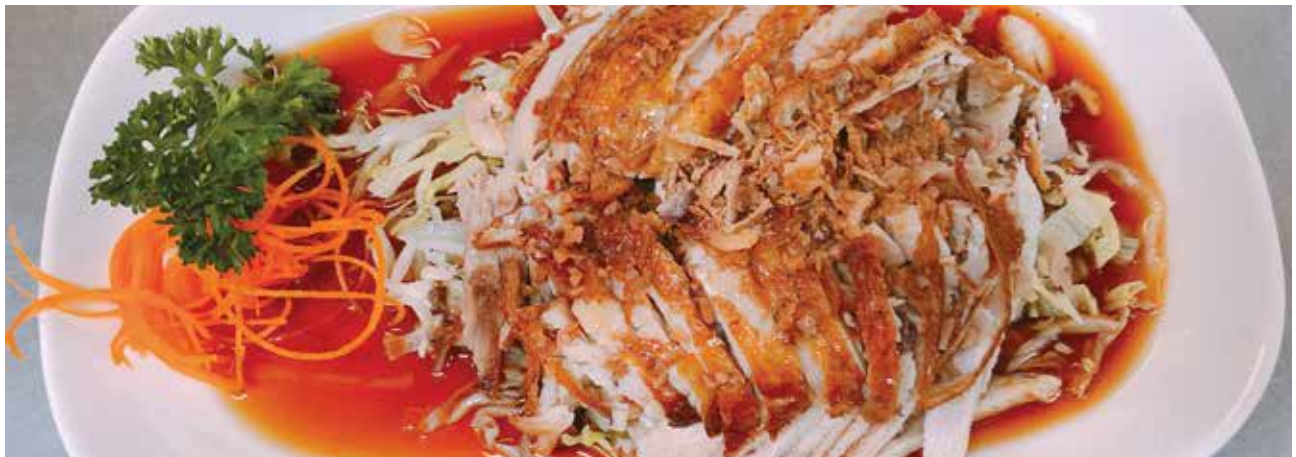
Shan-Tung Crispy Skin Chicken

Pepper Sauce Beef Steak & Scallops Hot Pot $29.80