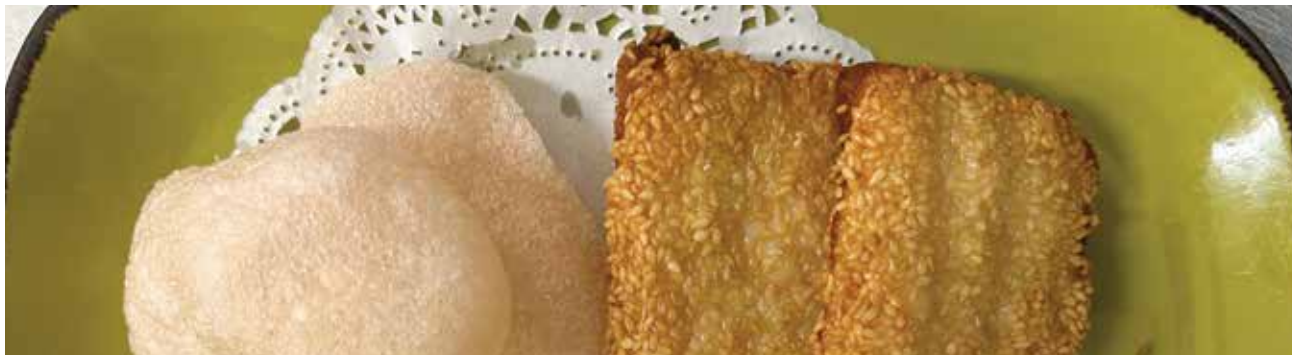
Sesame Prawn Toast