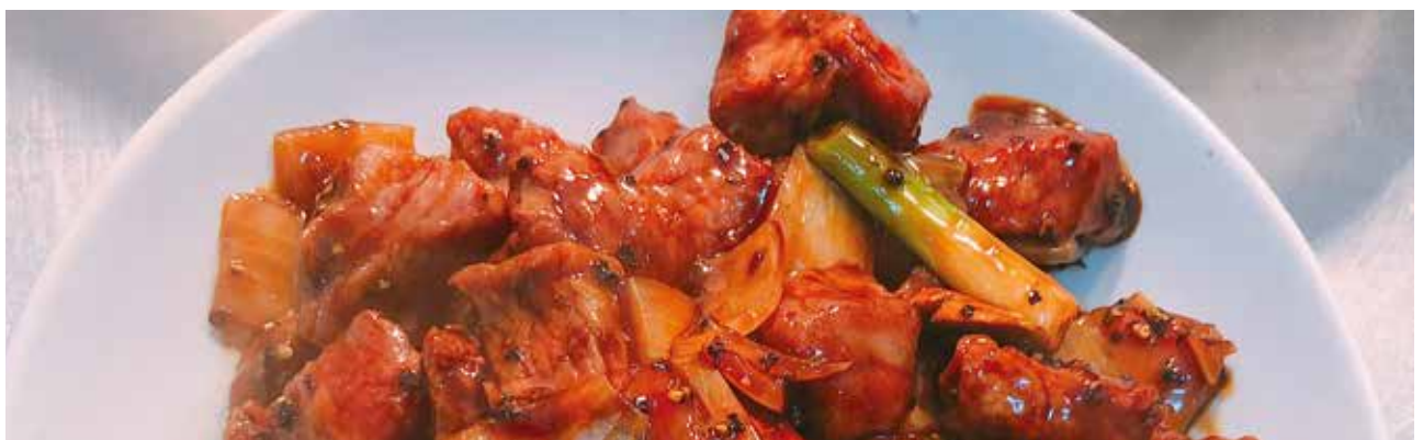
Beef Steak with Honey and Pepper sauce