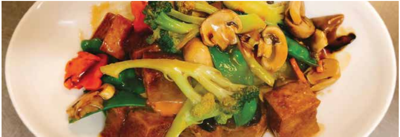
Fried Bean Curd with Mushrooms and Vegetables

Fried Bean Curd with Mushrooms & Vegetables $22.00